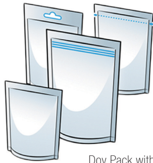
Doy Pack with... Zipper, Easy-Open, Euro-Hole, and more